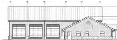
Proposed new fire station

In the case of a cardiac arrest patient or a fire, the 4 to 6 minute difference is crucial in saving a life or a home.”