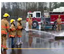
Student Fire Fighters

T his year, the South Bay Fire Department's "Blazing a Trail for Literacy" program teamed up with the South Bay Elementary PTA's BEAR Reading Program to promote reading at the school and provide increased incentives. The two week reading contest held in February and March, was for all students attending South Bay Elementary. Students recorded the number of minutes they read for the reading program and earned prizes. Additional recognition was awarded by our Department as well as Country Music vocal group, Gloriana.