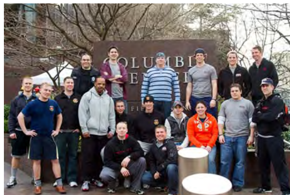
South Bay Fire Stair Climb Participants