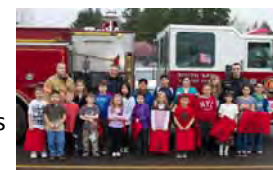
Proud winners of the reading contest

If you would like more information about any of South Bay Fire Department's Community Programs, please give us a call at (360) 491-5320.