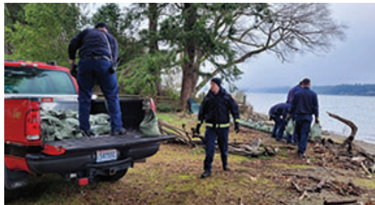
On-duty crew helping a resident with sandbags

Recent heavy rainfalls have caused flooding concerns for some residents. Thurston County Emergency Management provides filled and/or unfilled sandbags to fire departments in the county. The South Bay Fire Department keeps a supply at our North Olympia Station 8-3, located at 5046 Boston Harbor Road NE, Olympia, WA 98506. If any resident within our district needs sandbags for flood protection, we can help! We are even available to deliver and help set them up on your property! Call Station 8-1 at 360-491-5320 for more information.