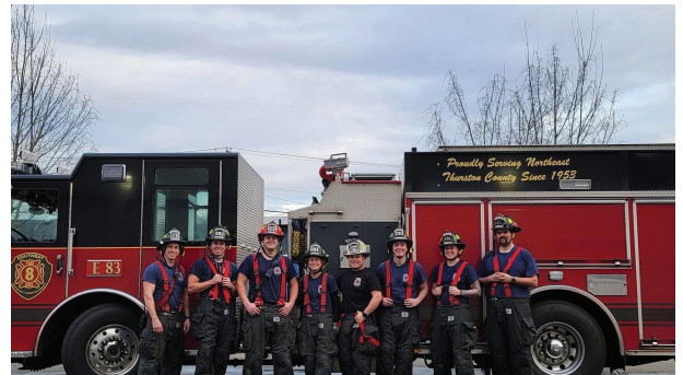
Proudly serving Northeast Thurston County since 1953